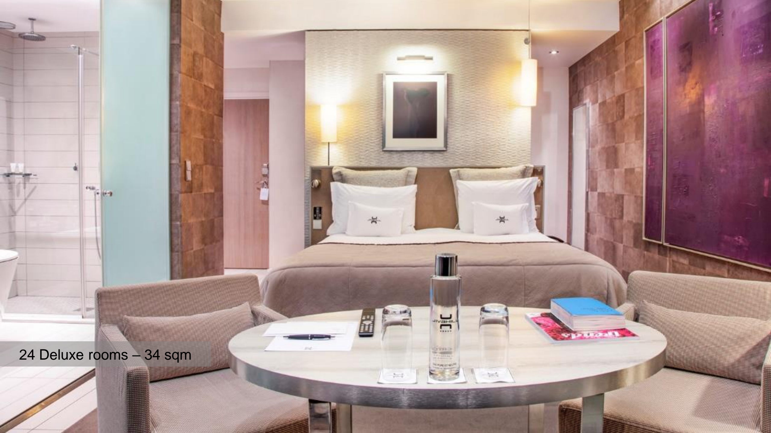
24 Deluxe rooms – 34 sqm