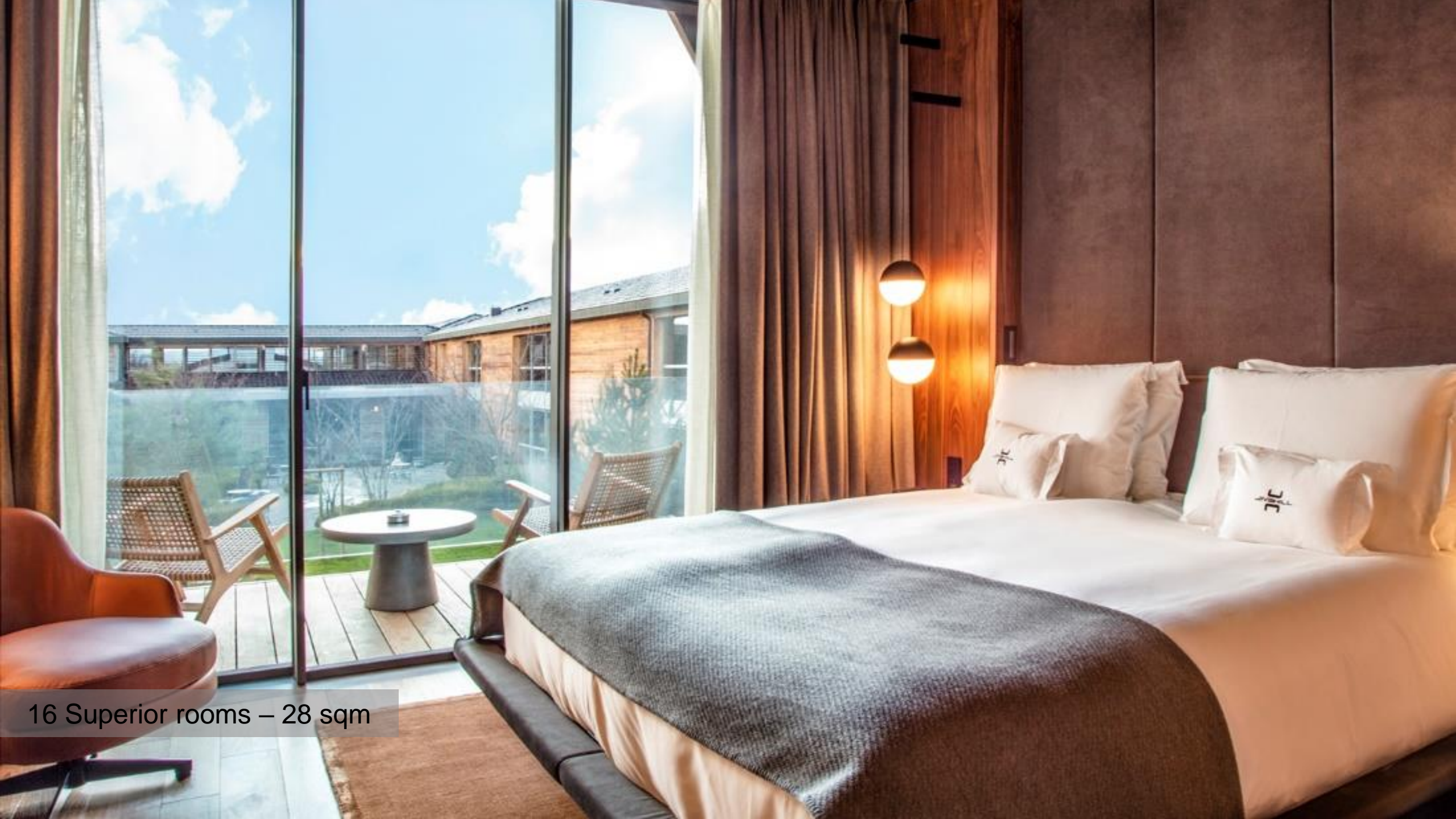
16 Superior rooms – 28 sqm