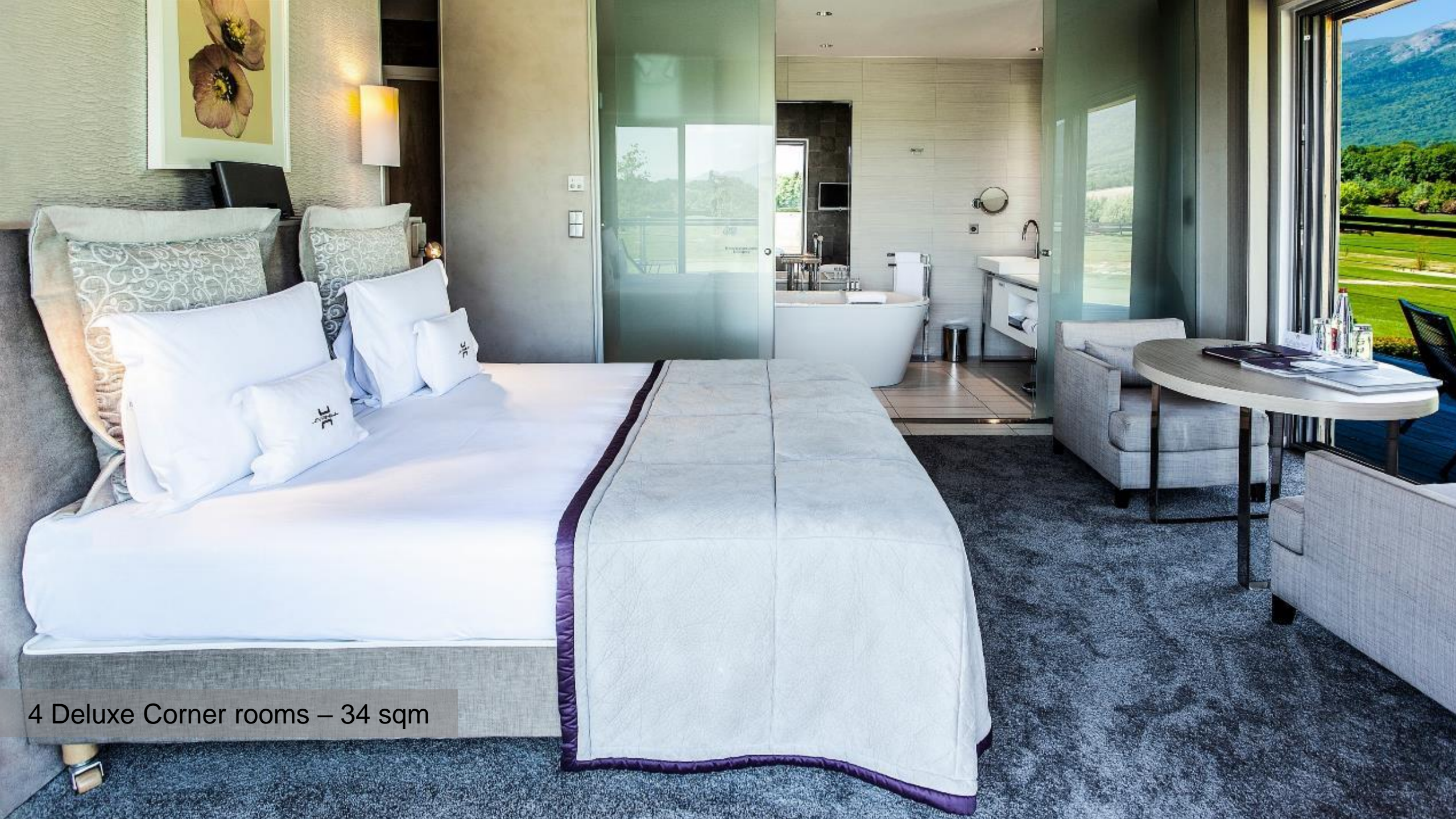
4 Deluxe Corner rooms – 34 sqm