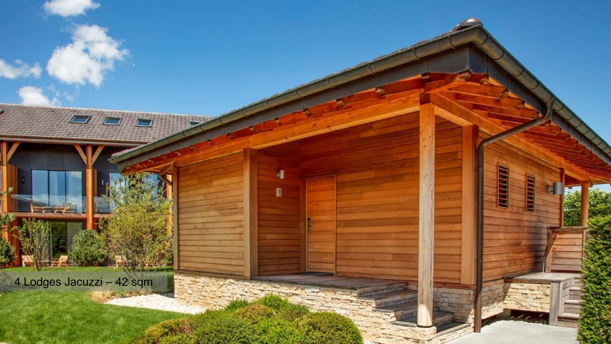
4 Lodges Jacuzzi – 42 sqm